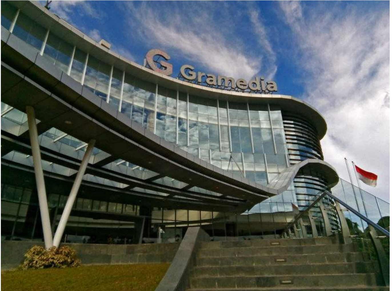
Gramedia is Indonesia's largest bookstore chain in Indonesia. Pictured above: Gramedia World in Palembang, South Sumatra

paper annually. Not all of these papers are used productively. As the country lacks a proper infrastructure and policy for nation-wide recycling, paper waste accounts for 28% of the total waste piling up in their landfills [8] .